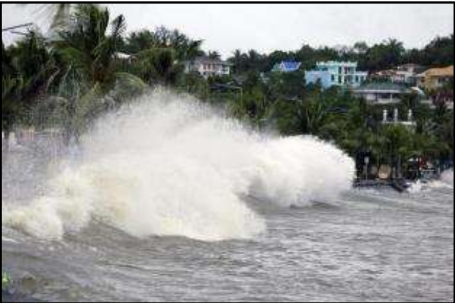
homes as the super typhoon, considered catastrophic and extremely dangerous, approached. New

Super typhoon Man-yi hit the Philippines on Saturday 16 November 2024, packing peak winds of 325km/h and causing 14 meter-high waves. This was the sixth major storm to hit the archipelago in a single month. The disaster resulted in substantial material damage, with trees uprooted and roofs ripped off. No casualties were reported, as residents followed evacuation instructions. More than 650 000 people were forced to leave their