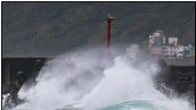
Meteorologists are forecasting destructive winds and over a meter of rain by 1 November. Kong-rey is considered to be the region's most powerful typhoon in 30 years.

Typhoon Kong-rey, accompanied by 184km/h winds, torrential rain and ten-meter waves, hit the island of Taiwan on 31 October 2024. The provisional toll is two dead and more than 500 injured. In anticipation of the storm, local authorities declared the 31st of October a day off. Offices and schools were closed, 298 international flights and all domestic flights were cancelled, and ferry operations were suspended. Around 35 000 soldiers have been deployed to take part in rescue operations. Evacuations have been ordered in eight counties and towns. The disaster caused flooding, landslides, power outages and extensive damage to infrastructure.