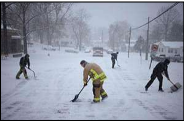
either cancelled or delayed. The severe storm also resulted in school closures and road accidents. New Courtesy: https://www.atlas-mag.net

Five deaths have been reported so far in the States of Missouri and Kansas. The capital, Washington, is also covered in snow. More than 50 million people have been affected by the disaster, with almost 200 000 still without power. The snow combined with the cold weather has led to power outages and poor traffic conditions. Air traffic was equally affected, as thousands of flights were